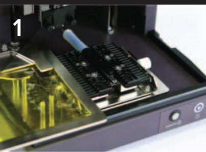
1 Place your object in the machine

The LD-80 has no complicated operating procedures and provides a simple 4-step process.