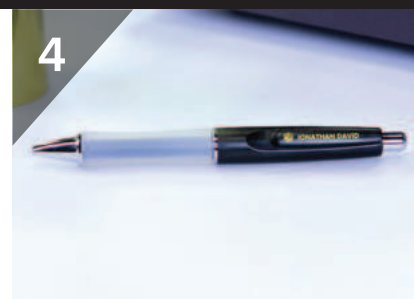
4 Your customized object is ready to sell