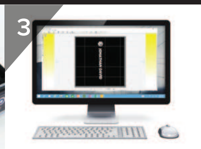
3 Laser imprint your design via METAZAStudio Software